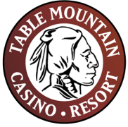
Table Mountain Casino Resort